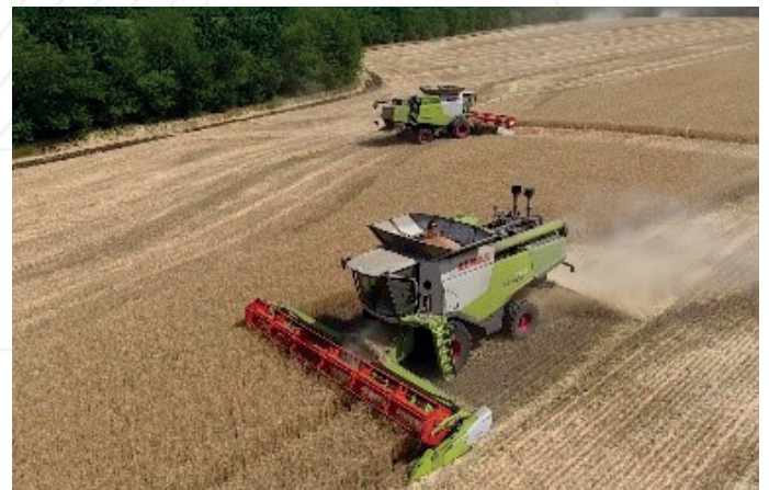
Constant updating of agricultural machinery