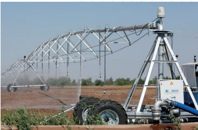
Modernization of the irrigation system