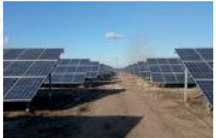
Construction of solar power plant