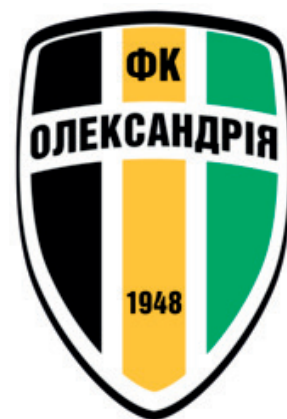
Professional football club FC "Oleksandriya"