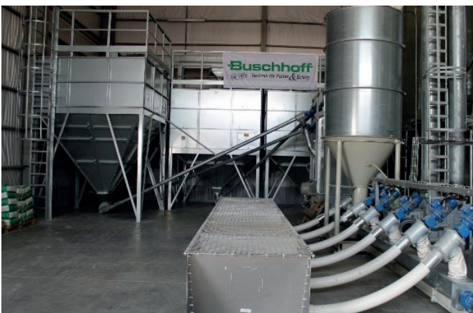
Setting up our own feed production line